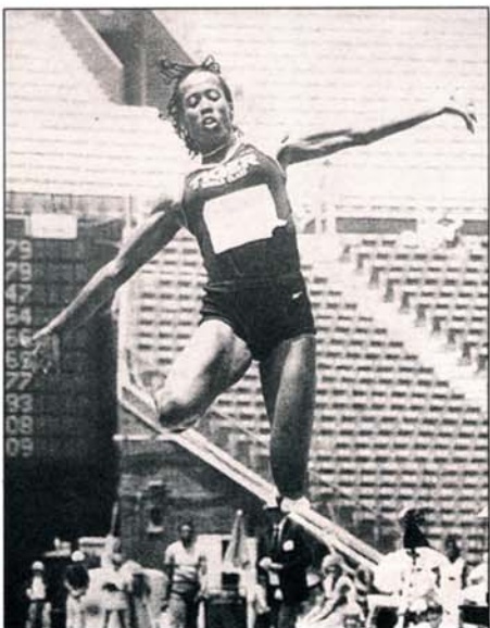
Jackie Joyner-Kersey, heptathlon world record-holder, is B/C grad.

That's a dynamite package, geared toward an overriding goal: to make the talented young player markedly more proficient through a one-week cram course.