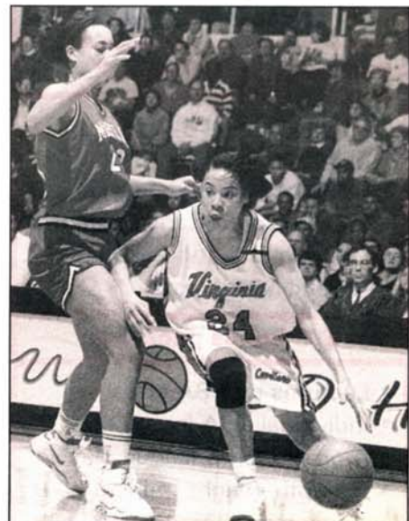
Virginia All-American Dawn Staley: B/C in '87, Final Four MVP in '91.