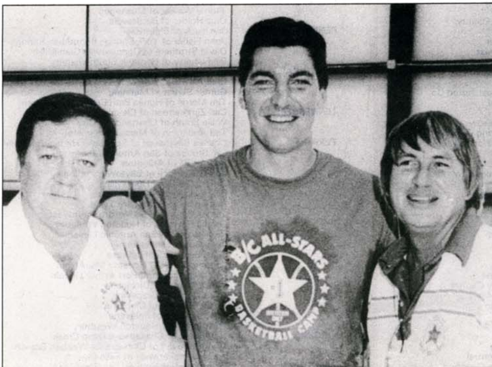
Detroit Pistons muscleman Bill Laimbeer, who led NBA in rebounding in 1986, has lectured "Junior B/C" campers in both Indiana & Georgia in recent years.